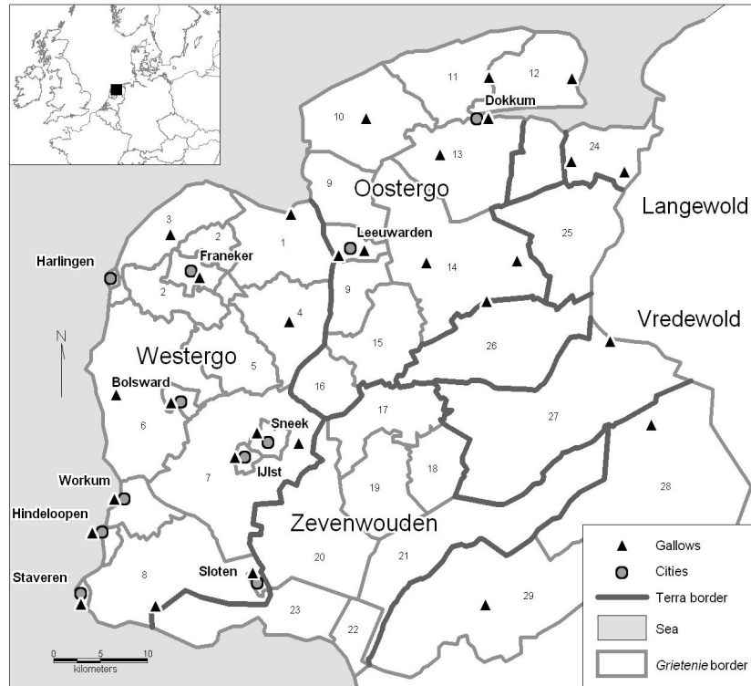
Frisia west of the Lauwers and its political division in the fifteenth century: the terrae , the grietenien and the cities.